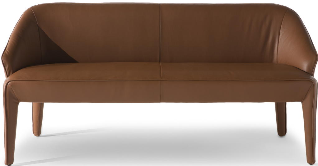
■ Vers. 539