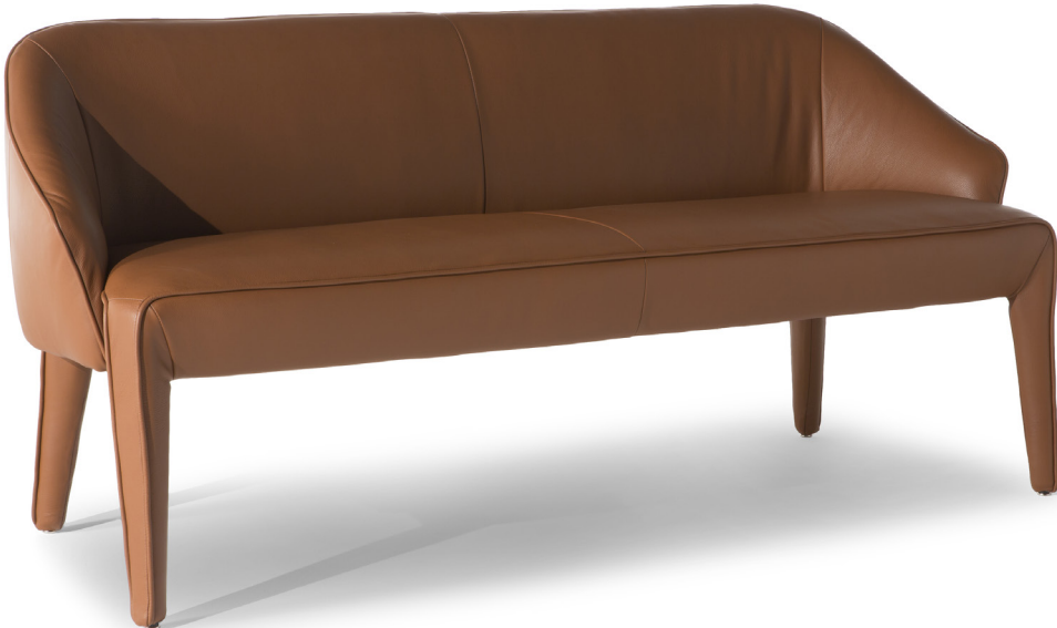
■ Vers. 539