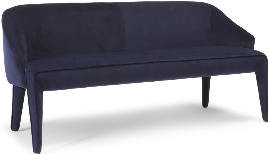
■ Vers. 539

ALL PICTURES SHOWN ARE FOR ILLUSTRATIVE PURPOSE ONLY. ACTUAL PRODUCT MAY VARY DUE TO PRODUCT ENHANCEMENT.